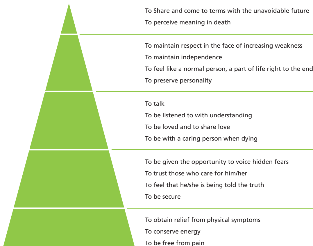
Fig 1 Hierarchy of the Dying Person's Needs (Goff 1999)

Residents in residential care facilities have the same needs for palliation and symptom management as those in other settings. However the evidence highlights that older people in residential facilities experience much poorer levels of pain management than in other settings (Hanlon et al 2010). Pain is particularly problematic for older people as they age and for carers who work with older people, knowing when to intervene can be challenging. This is further complicated by confusion and dementia where the verbal expression of pain may be difficult or impossible. Care teams need to be highly sensitive to behavioural and emotional responses that may be associated with pain, to assess these appropriately and ensure that effective management plans are in place. We have highlighted pain as a particular focus of symptom management, however attention also needs to be paid to a variety of needs that a person who is dying has. Goff (1999) suggests a hierarchy of needs (Figure 1)